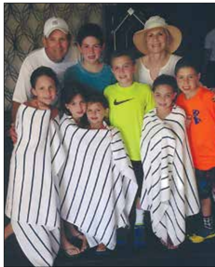
The couple and grandkids in South Beach in 2014.